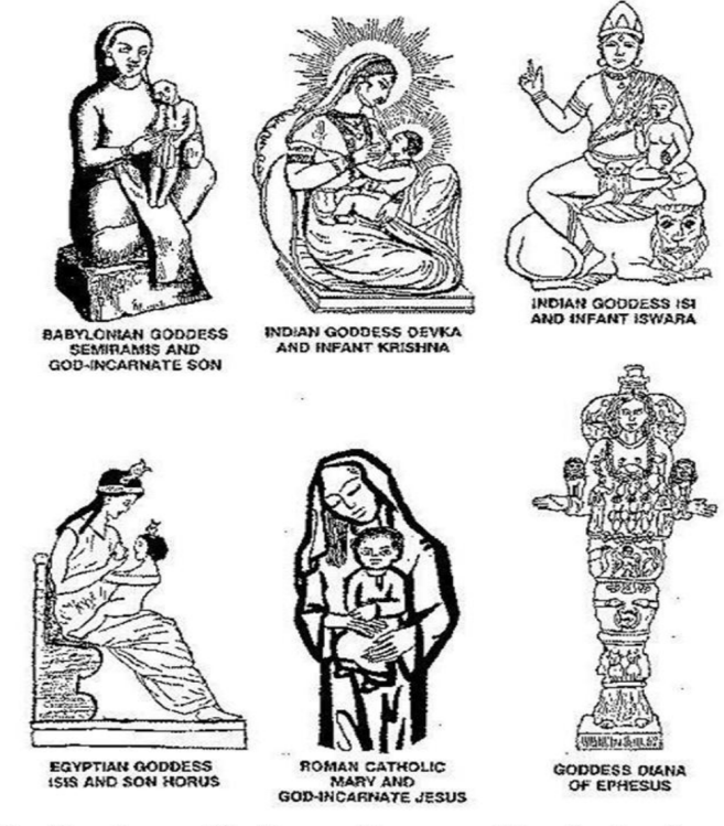
The Many Faces of the Queen of Heaven and How She Has Been Represented by Different Religions Throughout the Ages